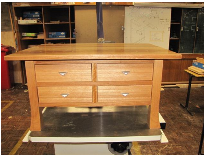
David Bywater's coffee table.