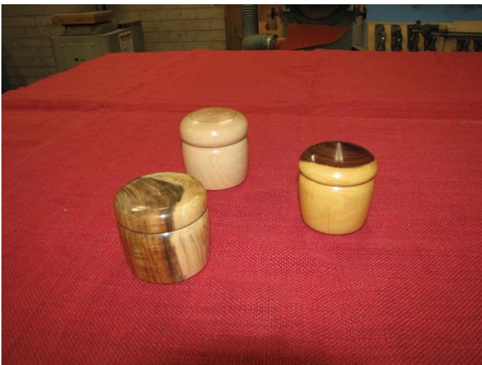
Ted Batty, turned boxes

The July meeting also included the bring along your favourite jig or tool included in the photos below.