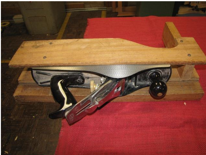
Ian Hunt Shooting board