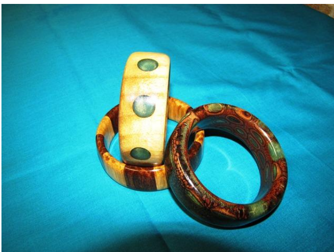
Ted Batty's resin inspired bangles