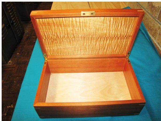
Mary Furness:- document box, great job!